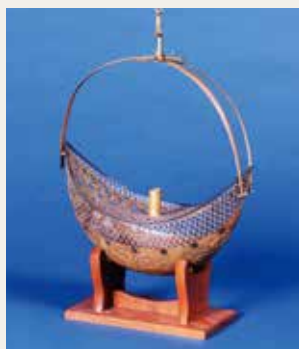
Boat-shaped Hanging Vase with Gold-gilded Copperplate Latticework