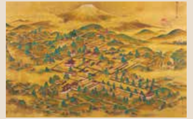
Map of Fuji Taisekiji in Suruga Province The Late of the Edo Period

*The contents of this exhibition may change occasionally.