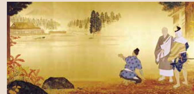
The Picture of the Establishment of Taisekiji