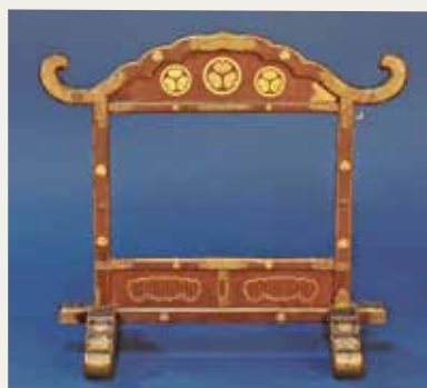
Stand for Hanging Kei, a Metal Sounding Instrument, with Hollyhock Tokugawa Shogunate Family Crest in Maki-e Technique of Gold Lacquer