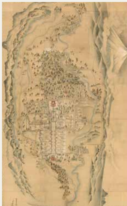
Map of Taisekiji Painted by Kano Shusen The Middle of the Edo period