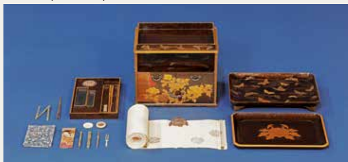
Portable Stationary Set Stand with a Drawer in Maki-e Technique of Gold and Silver Lacquer Decorations of Butterfly and Peony Design